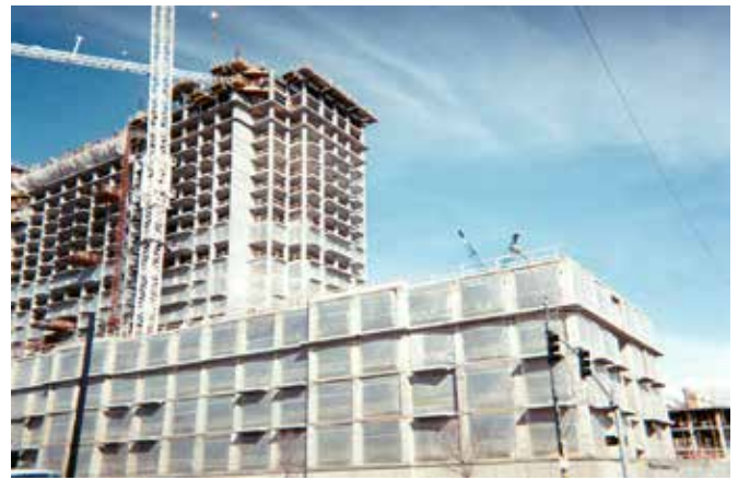
Building Abatement Enclosure

DURA♦SKRIM® 2FR and 10FR stock sizes are 6 and 20 feet wide by 100 feet long; they are also available in a variety of custom widths with minimum order quantities.