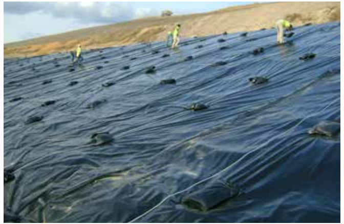
Temporary Rain Shed Cover