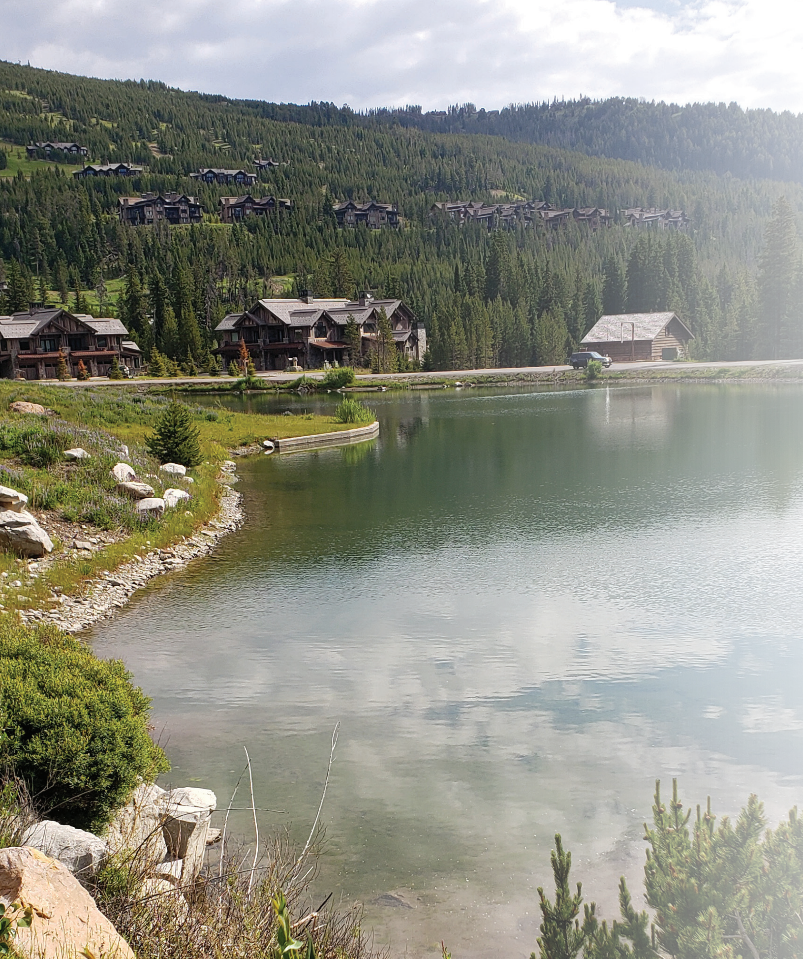
IRRIGATION & SNOW RESERVOIR – YELLOWSTONE CLUB, MT