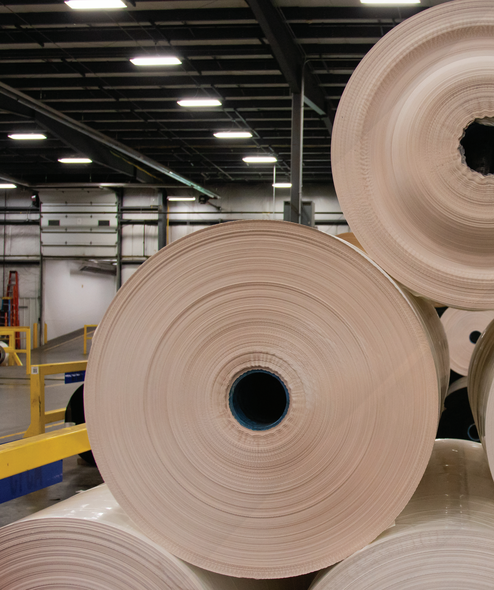
LED MOTION-ACTIVATED LIGHTING - SIOUX FALLS, SD