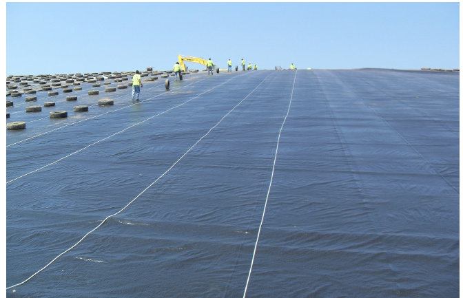
Temporary Rain Shed Cover